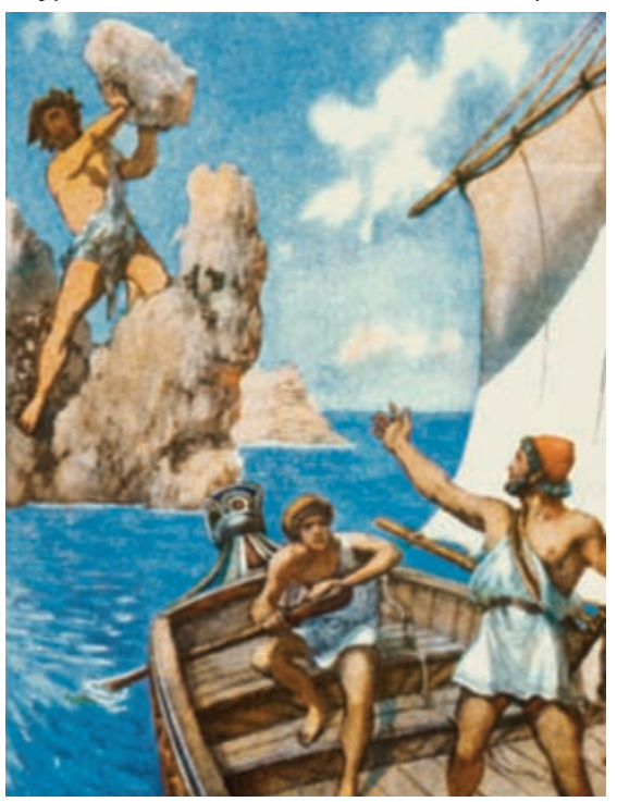
Detail of Odysseus and Polyphem (1910), after L. du Bois-Reymond. Color print. From Sagen des klasseschen Altertums by Karl Becker, Berlin.

This 1910 color print depicts Odysseus taunting Polyphemus as he and his men make their escape.