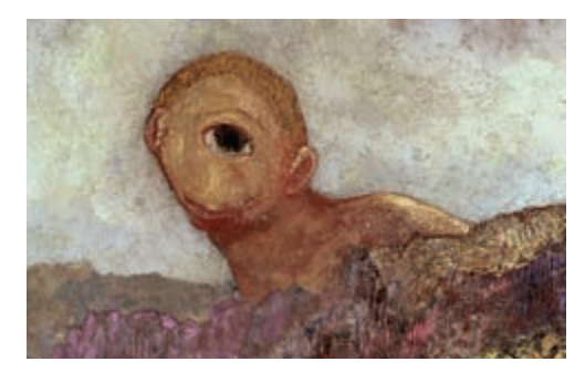
The Cyclops (c. 1914), Odilon Redon. Oil on canvas. Kroller-Muller Museum, Otterlo, Netherlands.

185 He thought he'd find out, but I saw through this, and answered with a ready lie: