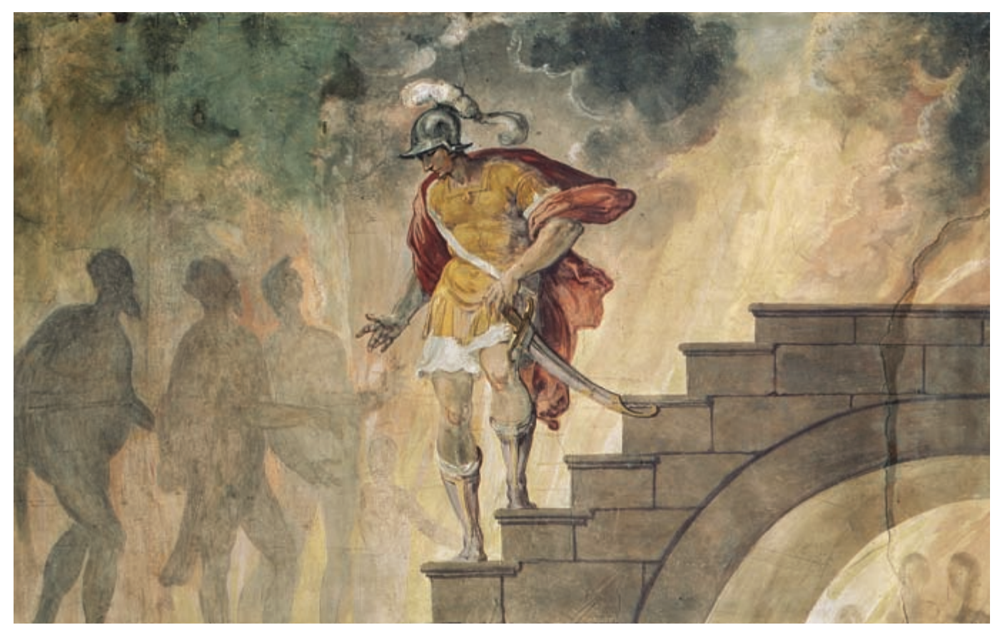
Ulysses Descending into the Underworld (16th century), Giovanni Stradano. Fresco. Palazzo Vecchio, Florence.