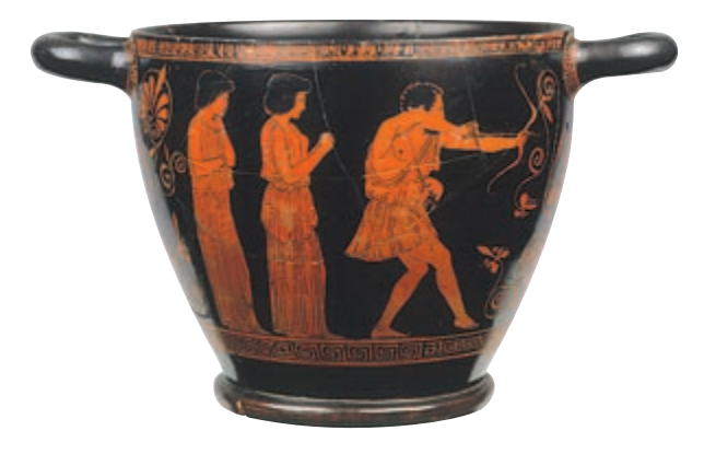
About 450–440 B.c.: Clay urn showing Odysseus slaying Penelope's suitors