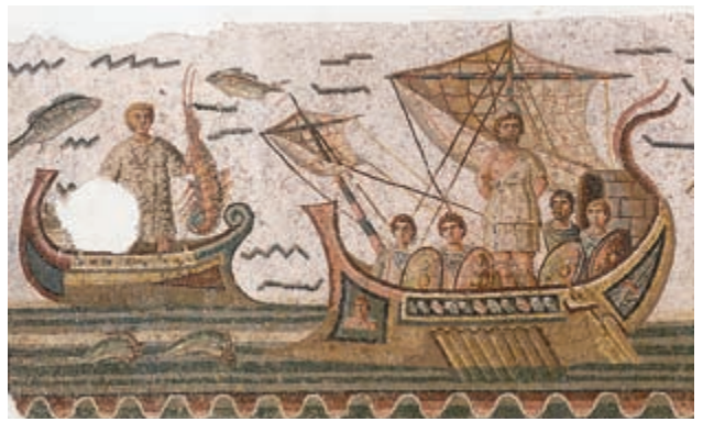
200s: Ulysses and the Sirens, Roman. Mosaic, 130 cm x 344 cm. Musée du Bardo, Tunis, Tunisia.