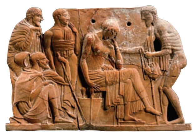
About 460–450 B.C.: Terra cotta plaque showing the return of Odysseus

1931–1932: Ulysses, Georges Braque. Pastel drawing.